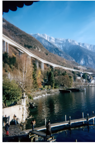
Chateau de Chillon, Montreaux