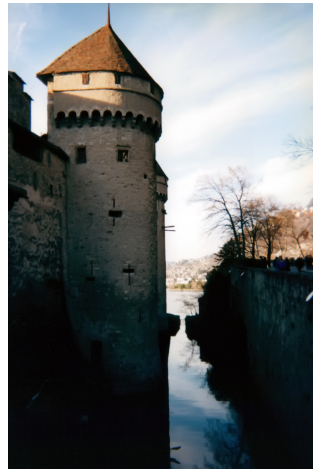
Chateau de Chillon, Montreaux