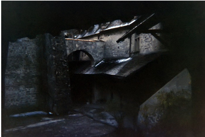
Chateau de Chillon, Montreaux