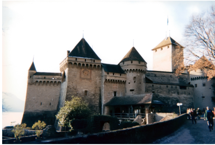
Chateau de Chillon, Montreaux