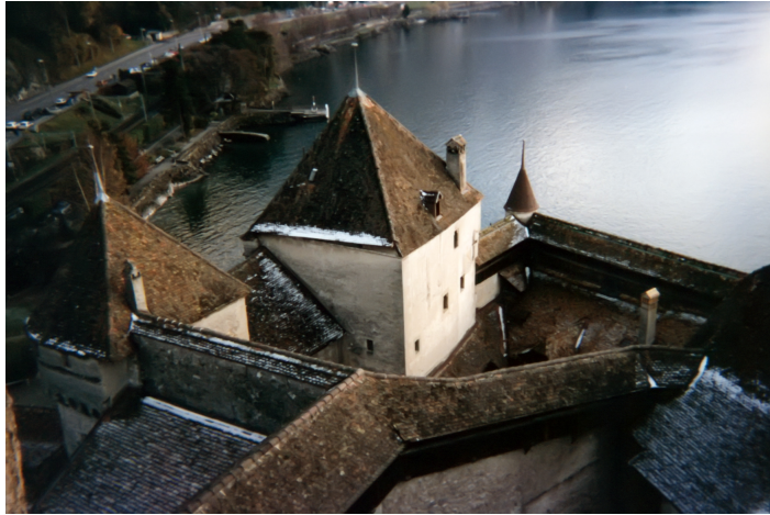
Chateau de Chillon, Montreaux