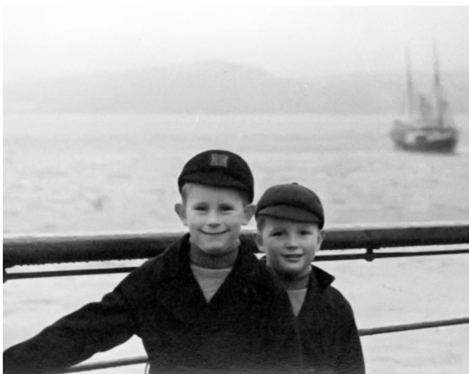
On the boat to Liverpool