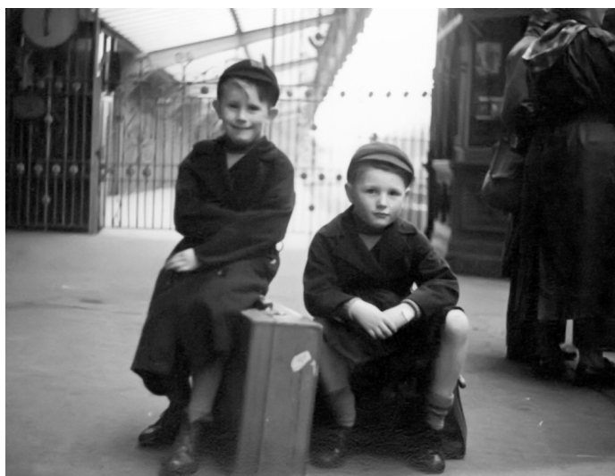
Liverpool Lime Street Station

I recall that the Burberry raincoats and shoes were bought specially for the trip. The caps were standard issue of the Rainey Endowed School.