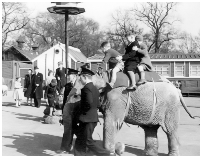
London Zoo, Regents Park