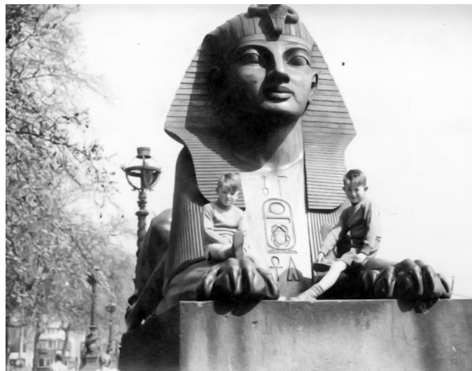
Along the Embankment