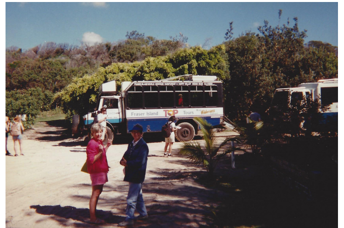
Fraser Island trip.