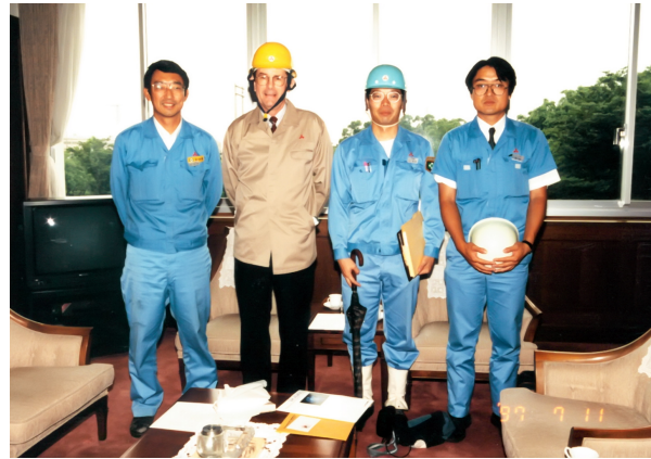
Visit to Mitsubishi, Takasago

Travel Himeji (15.04) - Matsumoto (19.06). Stay Matsumoto.