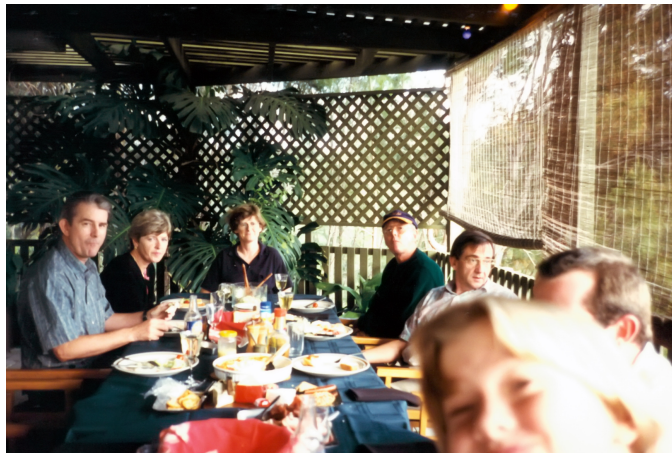
Earls family gathering.

C: Arrive Brisbane at 7.20am on Quantas360