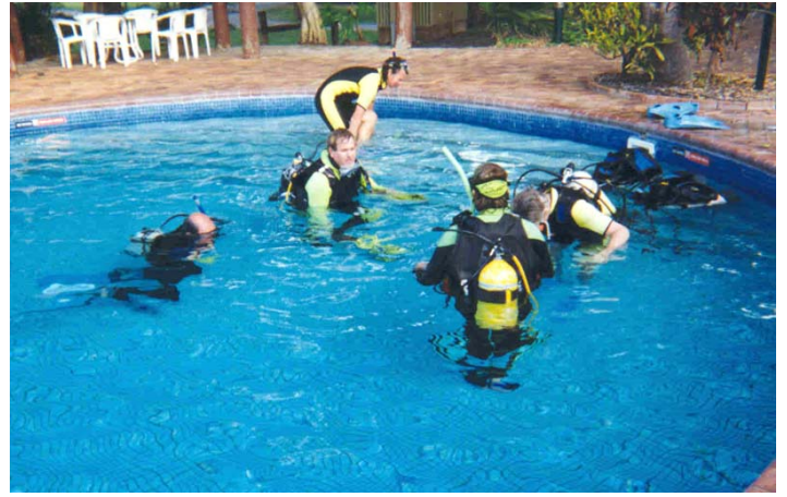
Great Keppel Island.