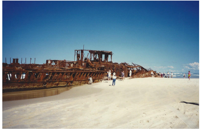
Fraser Island trip.