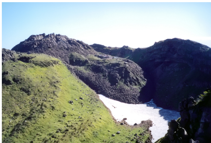
Chokai from trail.