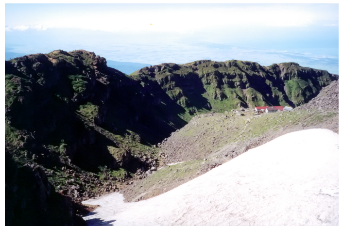
View (with shrine) from near Chokai summit.