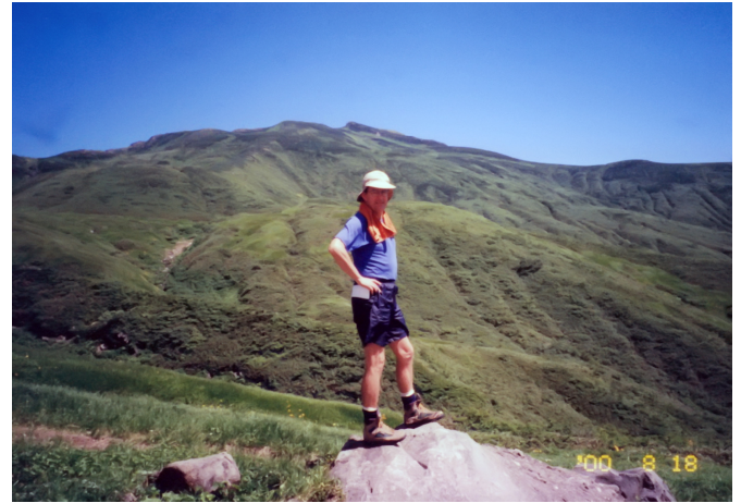
On the descent route.