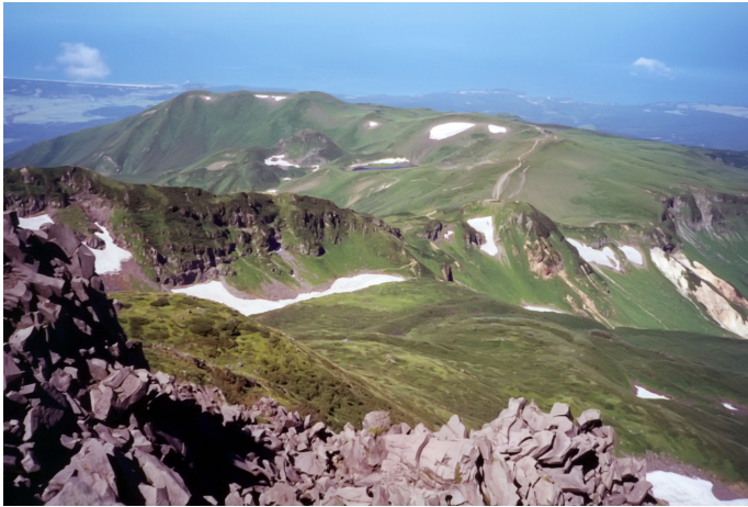
View from Chokai summit.