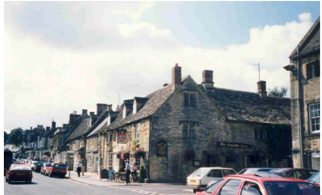
The Trout Inn, Oxford, and Burford Village