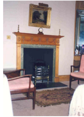
In Woodstock, Oxford