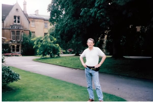
In Balliol College, Oxford