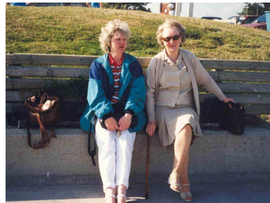
In Dublin with the Mills