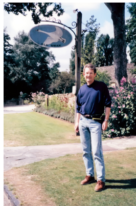
In Minister Lovell