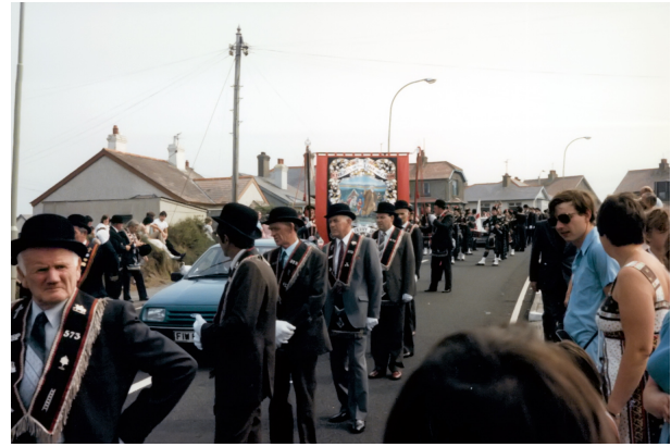
July 12, Portstewart