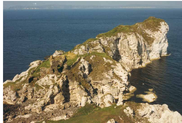
Family, Silverbay, and Kenbane Head