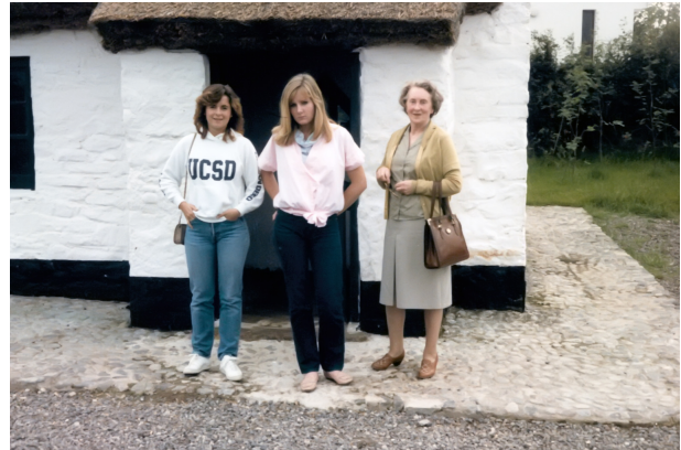
Port Braddon, Northern Ireland