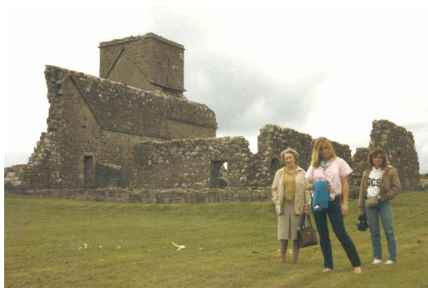
Devenish Island, Lough Erne