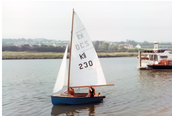
Sailing on the Bann River; Coleraine