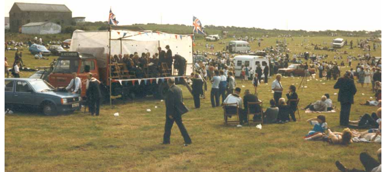
July 12, Portstewart