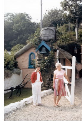
Port Braddon, Northern Ireland