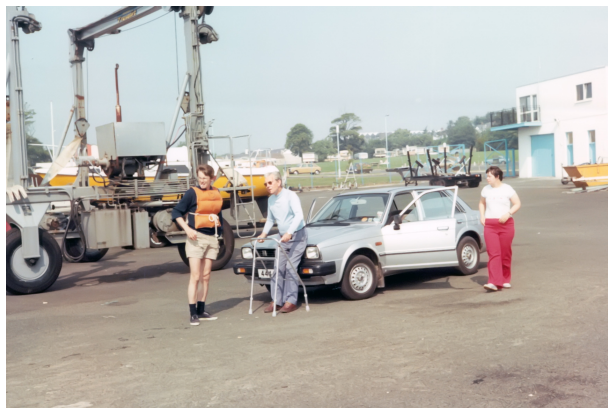
Sailing on the Bann River; Coleraine