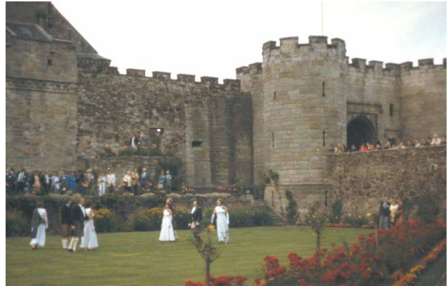
Sterling Castle, Scotland