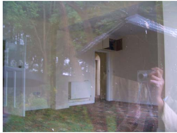
Mweelrae, old Badger home, Magherafelt

Sep.3 Thurs, Sep.3, 2009. Drove to Donegal. Stayed in O'Donnell's Bar and Grill