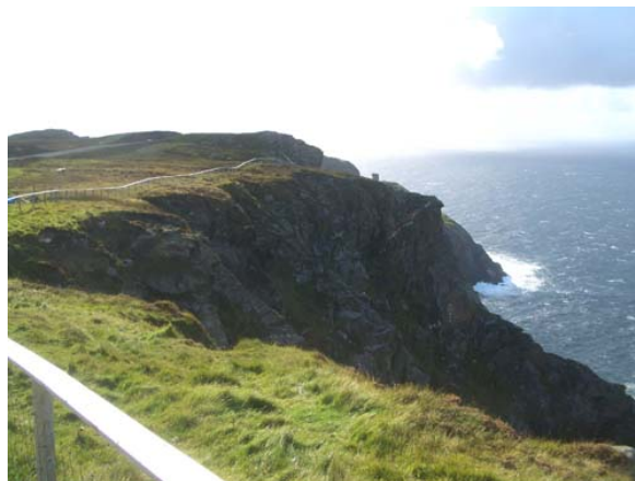
Slieve League, Donegal

Sep.4, 2009 Fri Drive to Manor House, Enniskillen 7.30pm Reunion Dinner, Manor House, Enniskillen Stay at Manor House