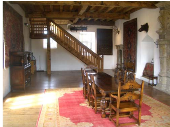
Donegal Castle, Donegal