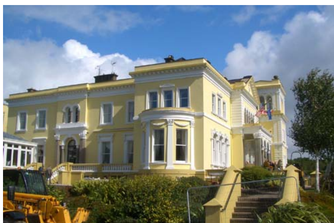
Manor House Hotel, Fermanagh