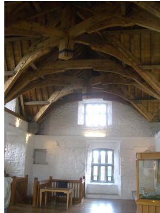
Donegal Castle, Donegal