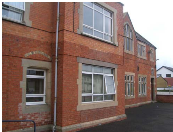
Rainey Endowed School, Magherafelt