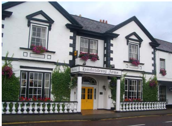
Londonderry Arms, Carnlough

Flew BE412 from Birmingham to Belfast Harbor Stayed at Londonderry Arms Hotel in Carnlough