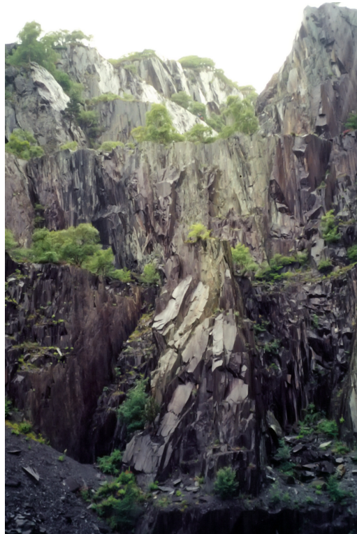
Old slate quarry