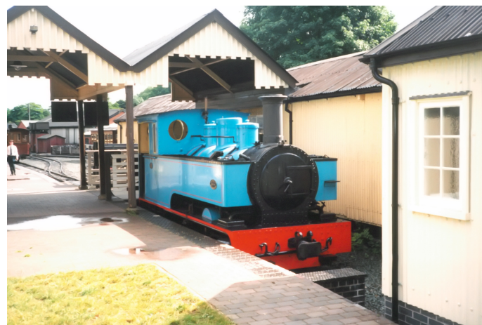
??? Castle and narrow gauge railway