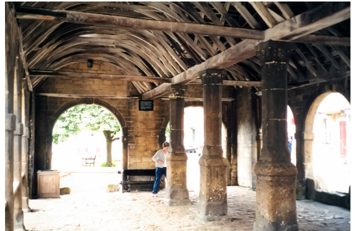
Chipping Camden village market