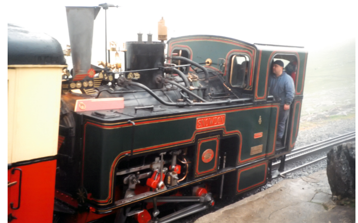
Mount Snowdon railway