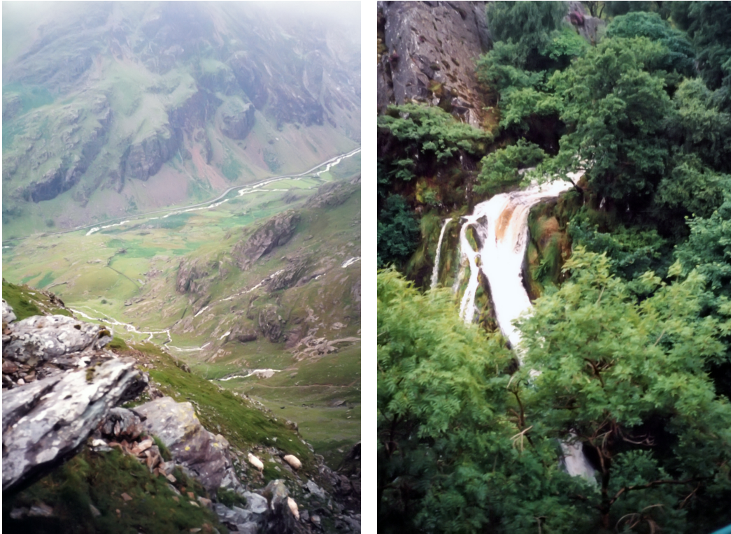
On Mount Snowdon