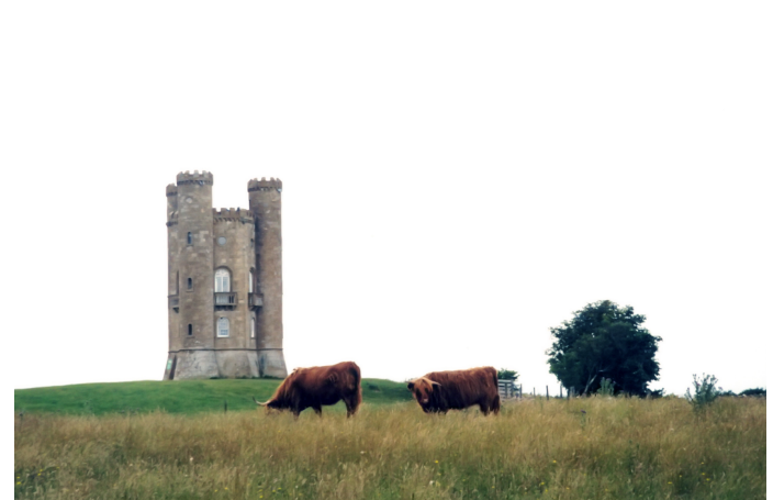
Stratford and Broadway Tower