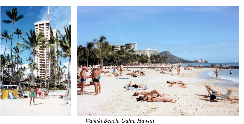
Friday, Mar.18, 1988

Flew UA812 from Honolulu, Hawaii, to LAX