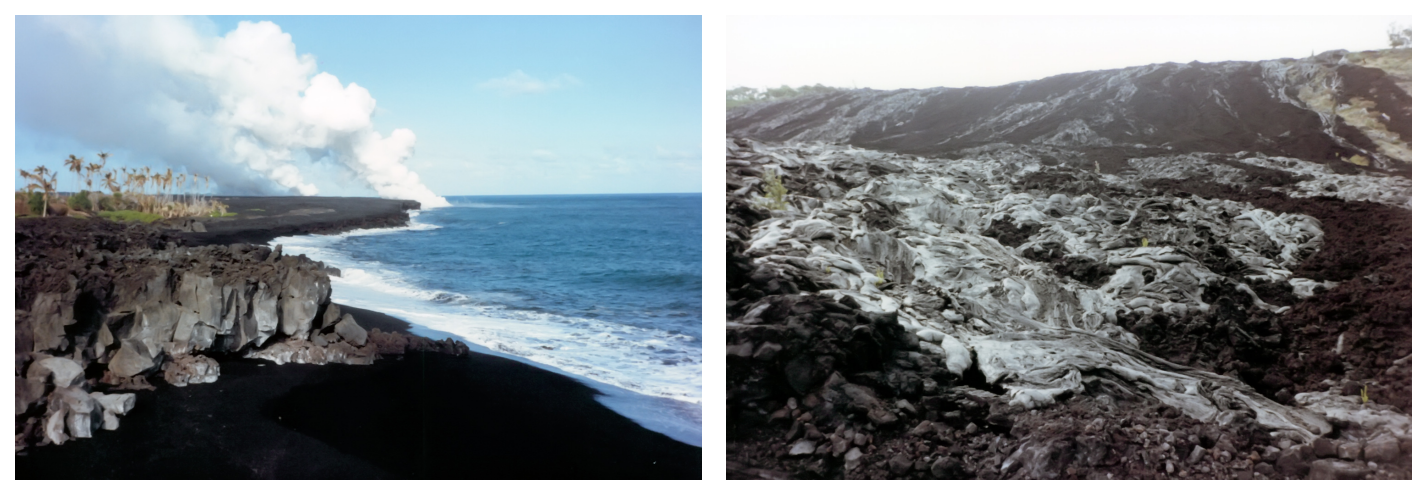
Volcanoes National Park, Big Island, Hawaii