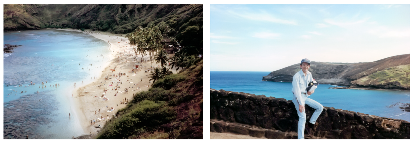
Waimanalo Beach, Oahu, Hawaii