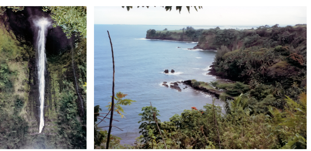
?? Waterfall on Big Island, Hawaii

Wednesday, Mar.16, 1988 Flew Hawaiian Air 132 from from Honolulu to Hilo, Hawaii