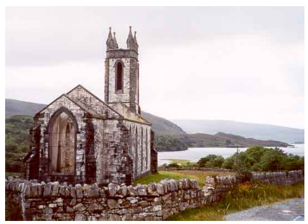
Ruined church overlooking Dunlewy Lake

At the end of the road at the entrance to the Poisoned Glen and just past Dunlewy village stand the mute ruins of a church. The walls of this haunting edifice are still complete. Indeed the white marble of which it was built was quarried just a few hundred yards away; the marble glows in the soft Irish light. Adding to the mystery, the adjacent graveyard contains a single gravestone. Unlike the Glen one can find few willing to offer explanations for the demise of this church. At one time it served as the local parish church and was thus part of the English establishment. Some may suggest that