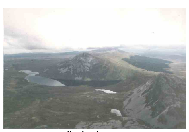
The route to the summit