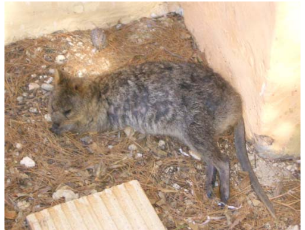
Quokka on Rottnest Island, Western Australia