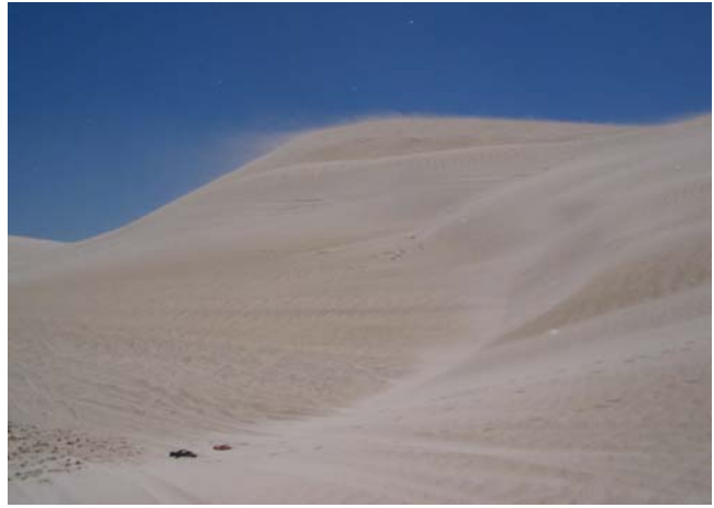
Sand dunes at Lancelin, Western Australia