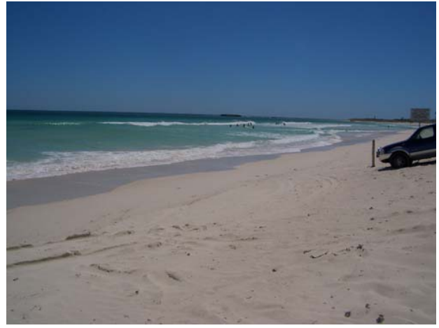
Sand dunes at Lancelin, Western Australia