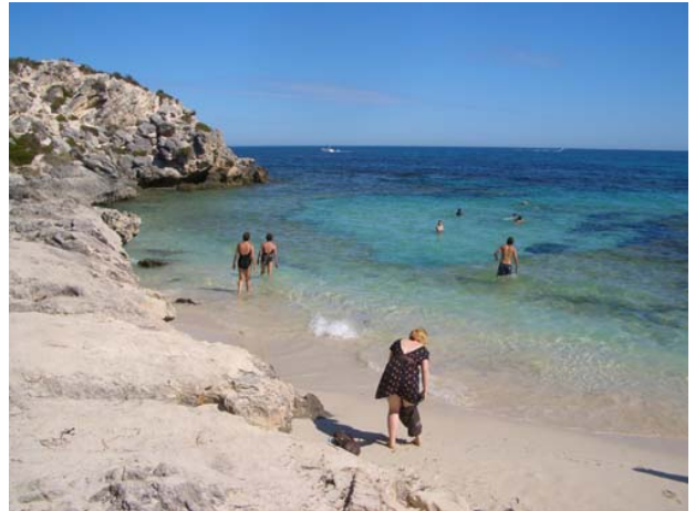
Rottnest Island, Western Australia