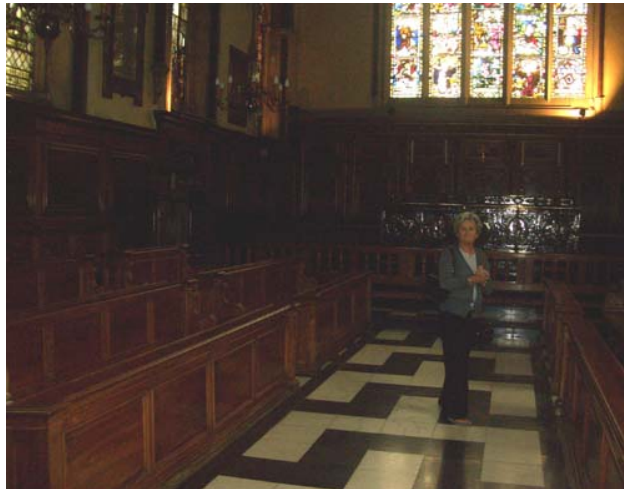
Balliol College, Oxford