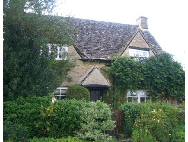
Black Swan and Minister Lovell, Oxfordshire