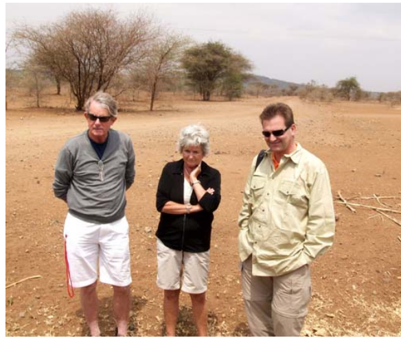
On the way to Ngorogoro Crater