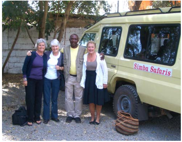
Ngorogoro Crater and on the way home