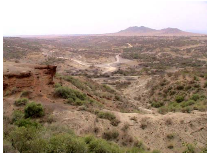
Masai village school and Olduvai Gorge