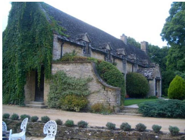
Black Swan and Minister Lovell, Oxfordshire

Aug.26 Wed Drive through Cotswolds to Binton Visit Warwick Castle Stay at Blue Boar, Binton