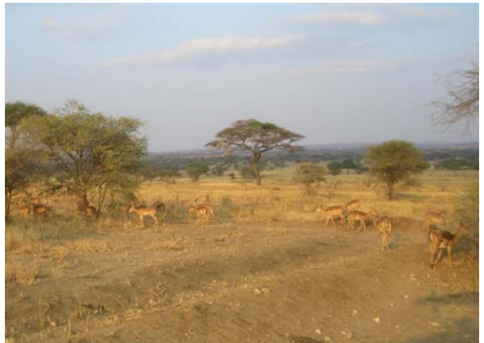
Arusha and Tarangire National Park