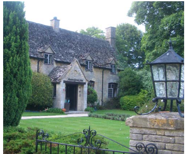
Black Swan and Minister Lovell, Oxfordshire