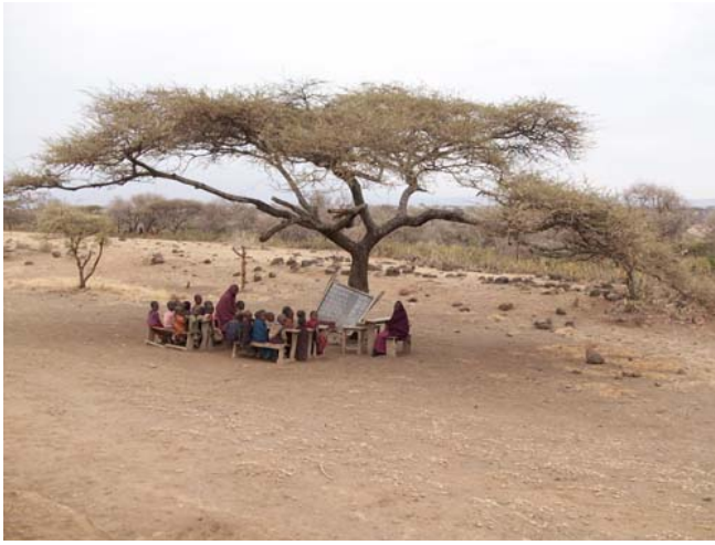
Masai village school