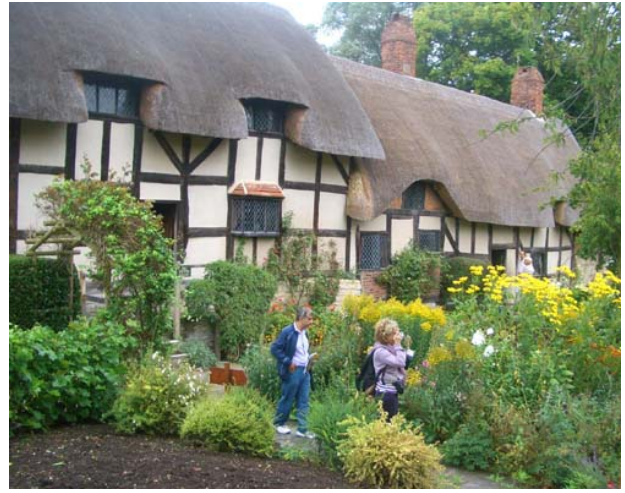
Anne Hathaway's Cottage, Stratford-upon-Avon