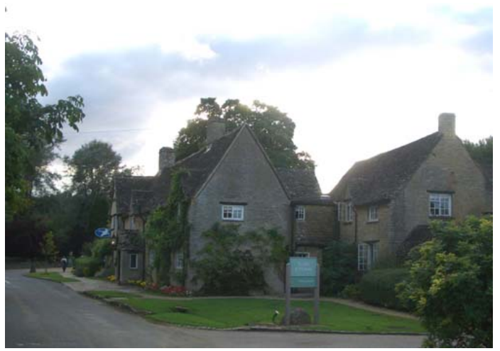
Black Swan and Minister Lovell, Oxfordshire