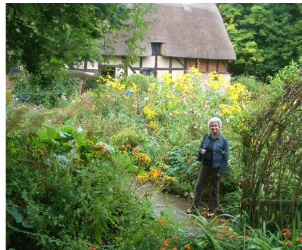
Anne Hathaway's Cottage, Stratford-upon-Avon

Aug.28 Fri Drive to Templetons Stay with Templetons