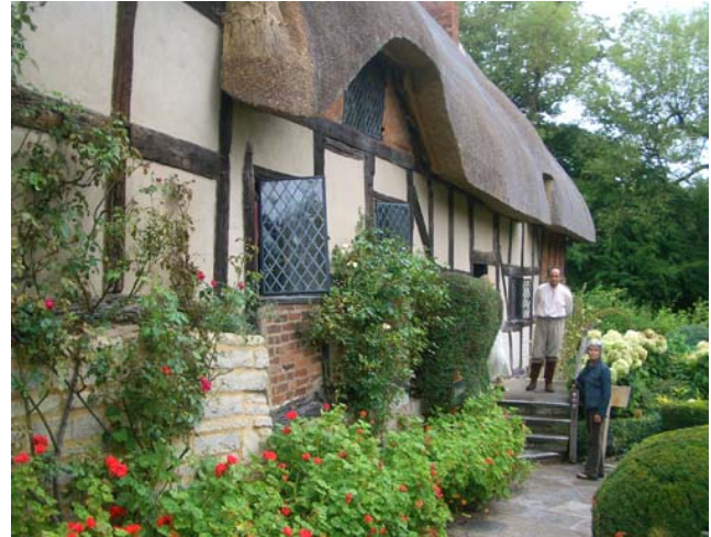
Anne Hathaway's Cottage, Stratford-upon-Avon