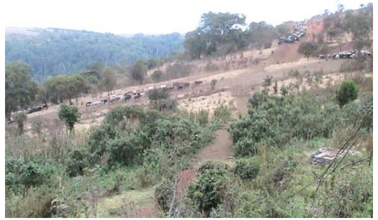
Serengeti National Park and Ngorogoro Crater