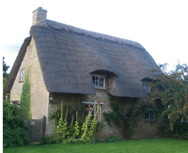
Black Swan and Minister Lovell, Oxfordshire