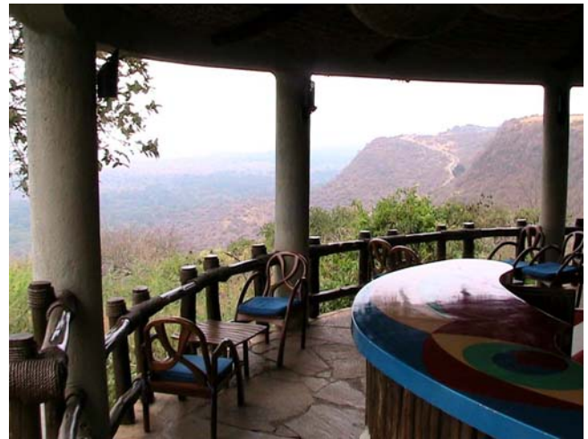
On the way to and at Ngorogoro Crater