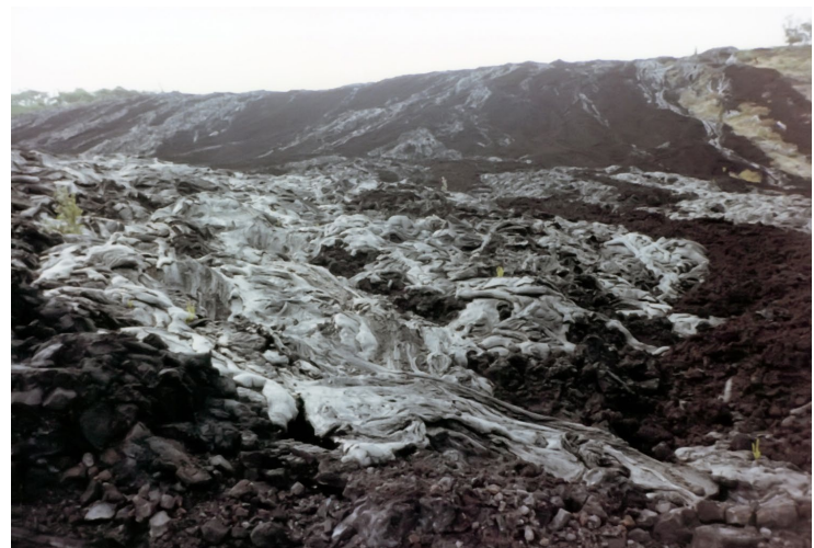
Volcanoes National Park, Big Island, Hawaii