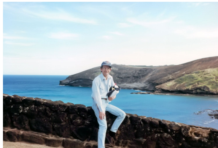
Waimanalo Beach, Oahu, Hawaii