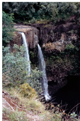
Volcanoes National Park, Big Island, Hawaii