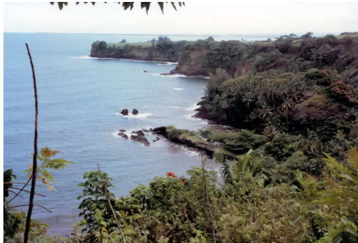
?? Waterfall on Big Island, Hawaii