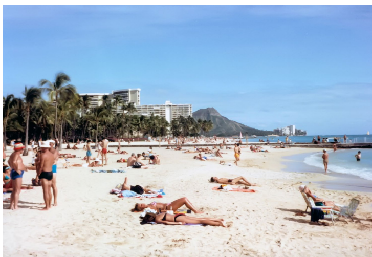
Waikiki Beach, Oahu, Hawaii