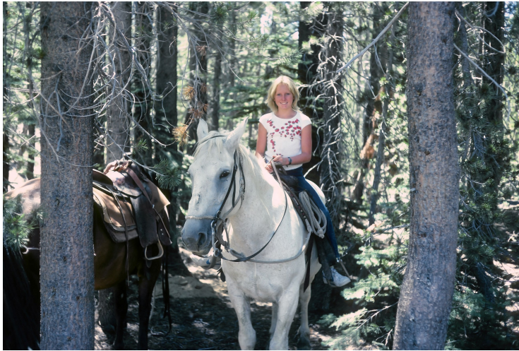
Horse ride in Mammoth