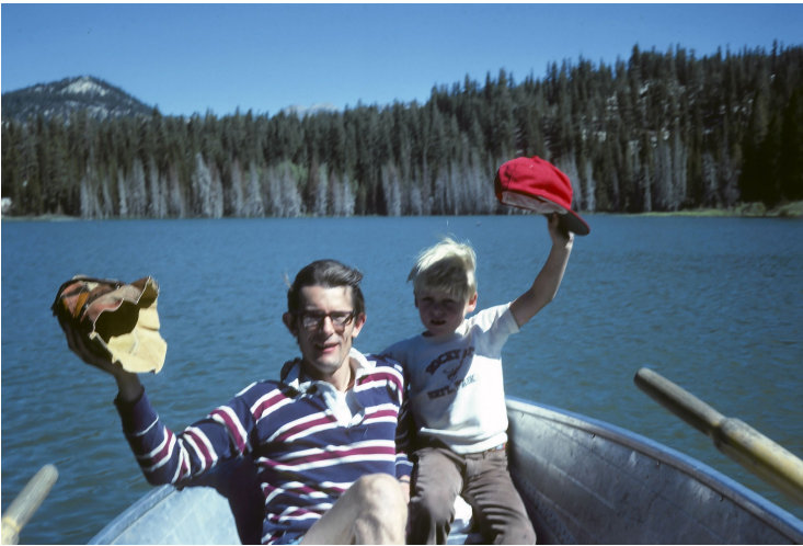
Boating on Sotcher Lake, Mammoth Lakes