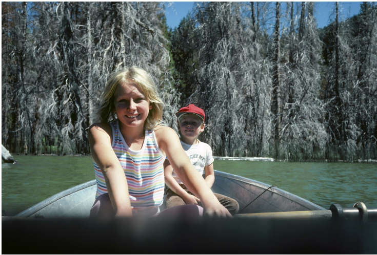
Boating on Sotcher Lake, Mammoth Lakes