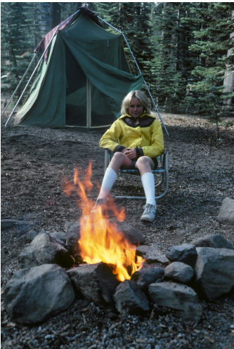
Red Meadows Campground, Mammoth