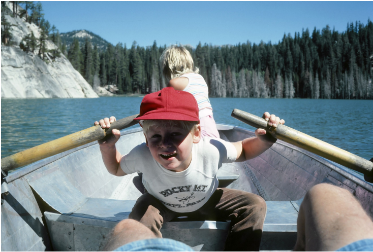
Boating on Sotcher Lake, Mammoth Lakes