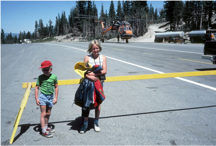
Trip to top of Mammoth mountain