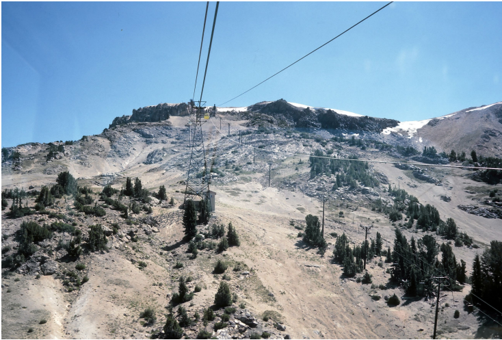
Trip to top of Mammoth mountain