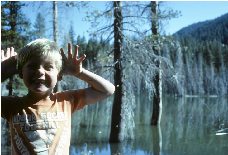
Boating on Sotcher Lake, Mammoth Lakes