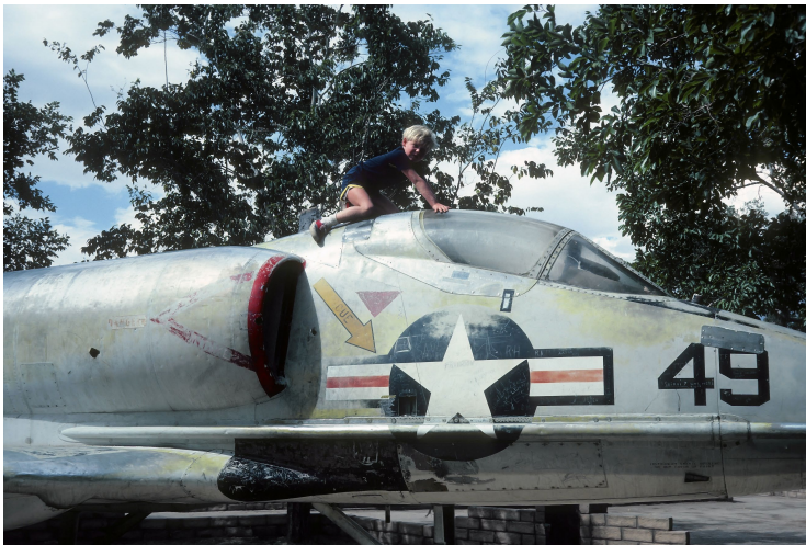
On the way to Mammoth Mountain