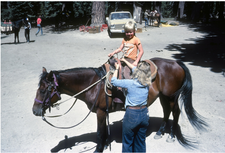
Horse ride in Mammoth