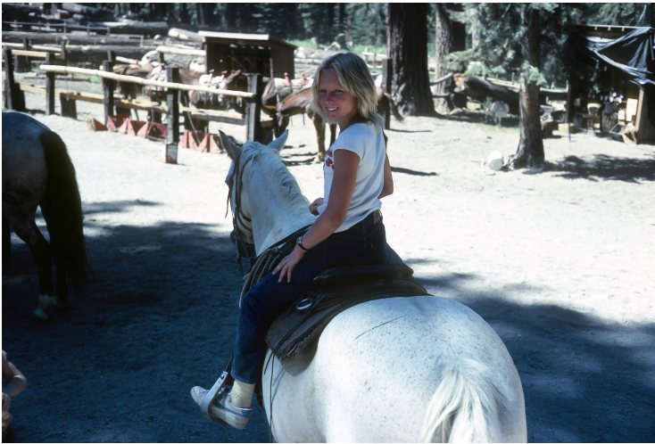
Horse ride in Mammoth