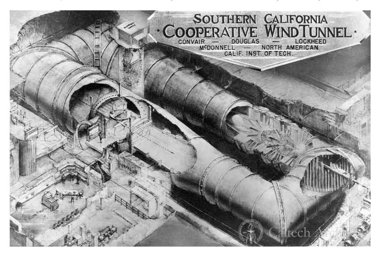
Figure 1: Russell W. Porter schematic of the Southern California Cooperative Wind Tunnel.

We begin with examples of wind tunnels designed for subsonic flows (M < 0.3). Though some wind