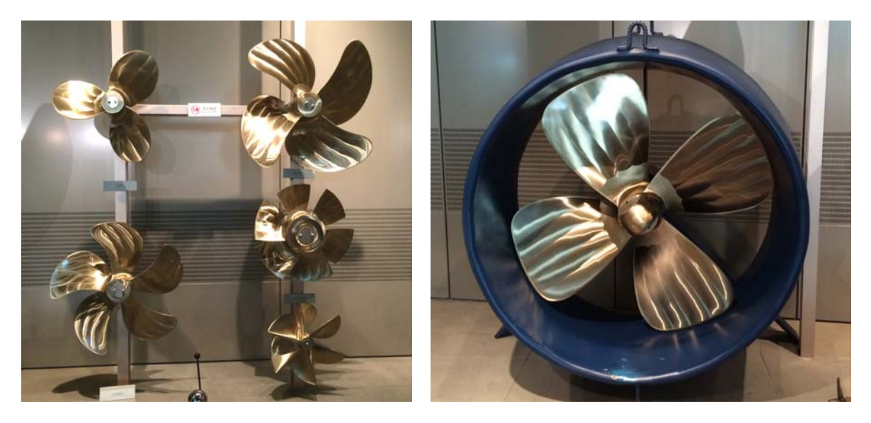
Figure 3: Left: Five different marine propeller designs. Right: Ducted marine propeller.

(namely one), ships are sometimes equipped with three and commercial passenger aircraft have at least two for safety reasons.