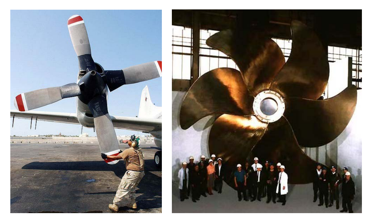
Figure 1: Left: Old style aircraft propeller. Right: Ship propeller

Though propellers were first fitted on ships in the 1830s, it was really the Wright brothers who began serious optimization of their design because of their critical need for lightweight and efficient propellers for their pioneering airplanes. Like the wings of an aircraft, propeller blades are most effective when they have a high aspect ratio, that is to say they are long and thin as exemplified by the aircraft propeller in Figure 1 (left). However, as with wings, structural limitations demand greater strength and this constraint is particularly severe for marine propellers which, to be sufficient strong and rugged, must have blades of much smaller aspect ratio as exemplified by Figure 1 (right). Thus the design of a propeller is influenced by